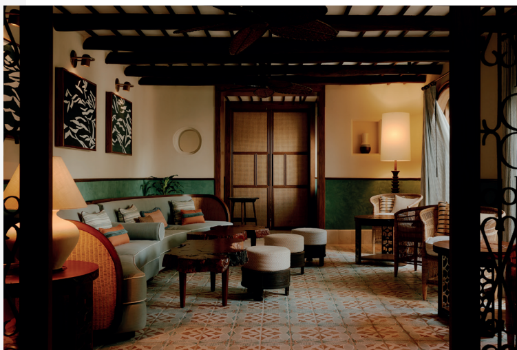
© Maroma, A Belmond Hotel, Riviera Maya