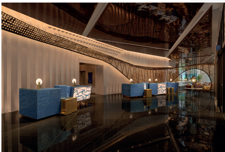
© W Macau – Studio City