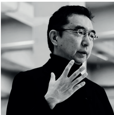
SOU FUJIMOTO Architect (Japan)