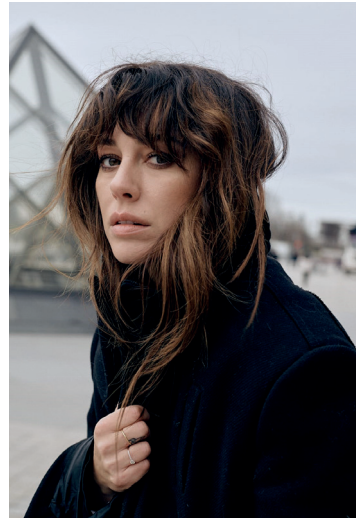
BLANCA SUÁREZ Actress (Spain)