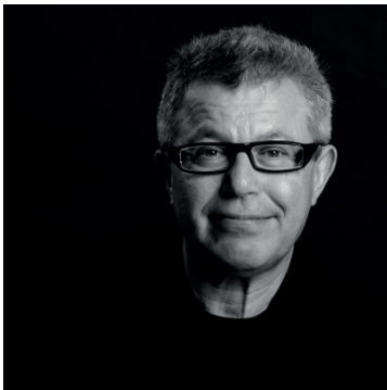
DANIEL LIBESKIND Architect (United States)