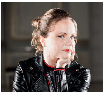
JULIA FISCHER Violinist (Germany)