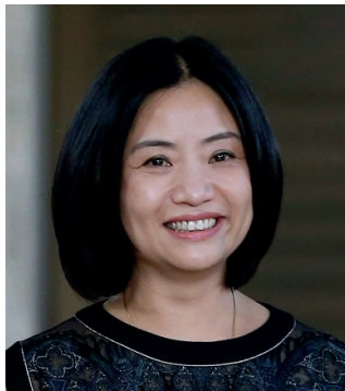
GUO PEI Fashion designer (China)