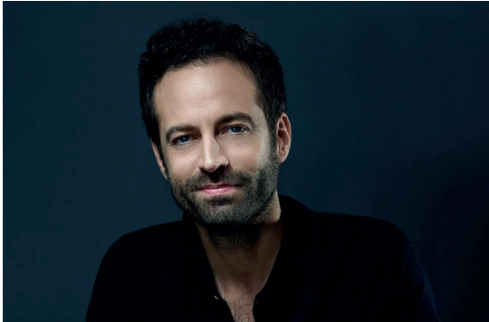
BENJAMIN MILLEPIED Dancer, Choreographer Chairman of the World Jury (France)