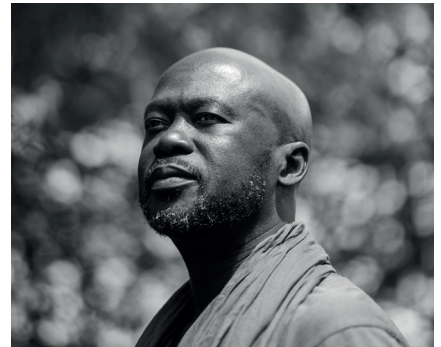
DAVID ADJAYE Architect (Ghana - United Kingdom)